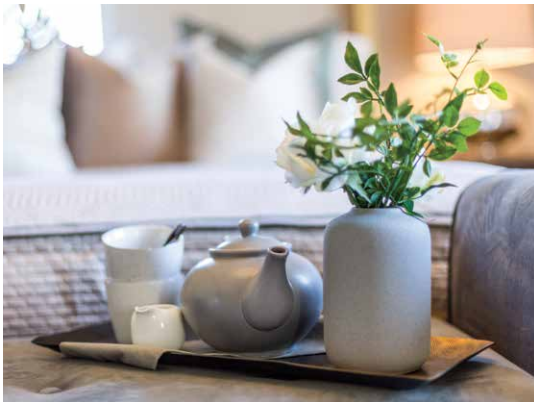
ABOVE & RIGHT Typical Devonshire Homes interiors — not site specific