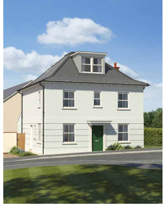
LEFT Modbury ABOVE Kilerton

Longston Cross takes its name from an old granite cross that stands beside the footpath that leads to Challabrook Farm. According to local legend it was used to mark the grave of a Royalist officer (called Longston) who was killed in the battle of Bovey Heath in 1646. It was here that Cromwell's troops defeated the Royalists in what was a regionally decisive battle during the English Civil War.