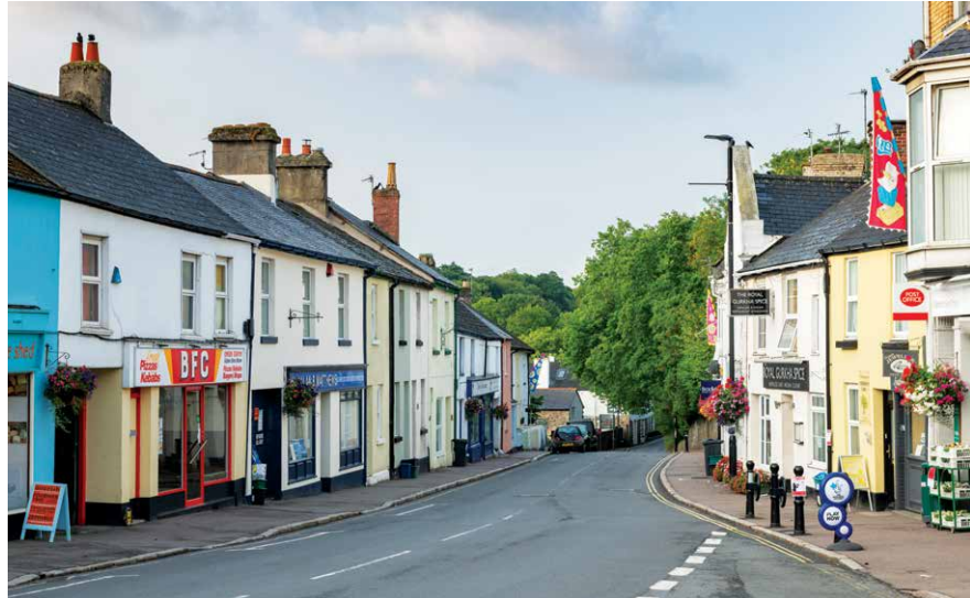
LEFT & ABOVE Haytor Rocks & Bovey Tracey High Street

The City of Exeter, with its historic cathedral and world-class shopping and dining, is only 15 miles from Bovey Tracey, and the beautiful South Devon coast is just 10 miles away.